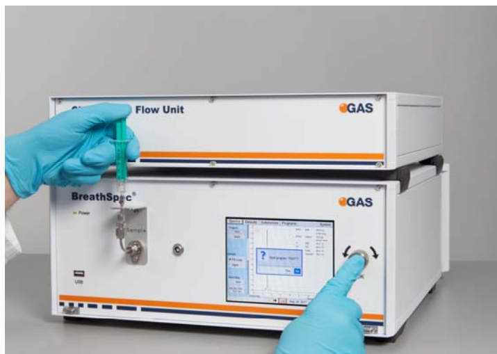
Fig.3: GC-IMS equipped with Luer adaptor

* IMS signal intensity correlates to concentration logarithmically rather than linearly