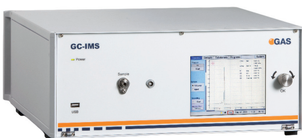
G.A.S. GC-IMS device

Even trace amounts of sulfur compounds in natural gas can lead to corrosion in pipelines and equipment. Measuring low concentrations helps prevent corrosion, extending the lifespan of infrastructure and reducing maintenance costs. Furthermore, maintaining low sulfur concentrations ensures the quality of the gas, optimizing industrial processes and preventing adverse effects on downstream equipment and operations. Quality control through precise measurement helps to ensure that the delivered natural gas meets customer specifications. Many industrial processes rely on catalysts, which can be sensitive to sulfur compounds. Measuring low concentrations prevents catalyst poisoning, preserving their effectiveness and efficiency. As well, monitoring and limiting sulfur concentrations in natural gas are essential for complying with environmental regulations.