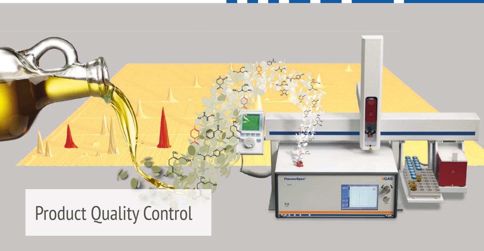
Product Quality Control