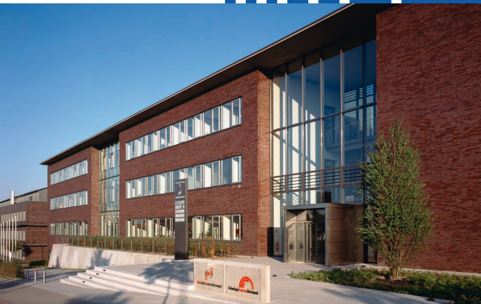
G.A.S. facility at TechnologyCenterDortmund, Germany