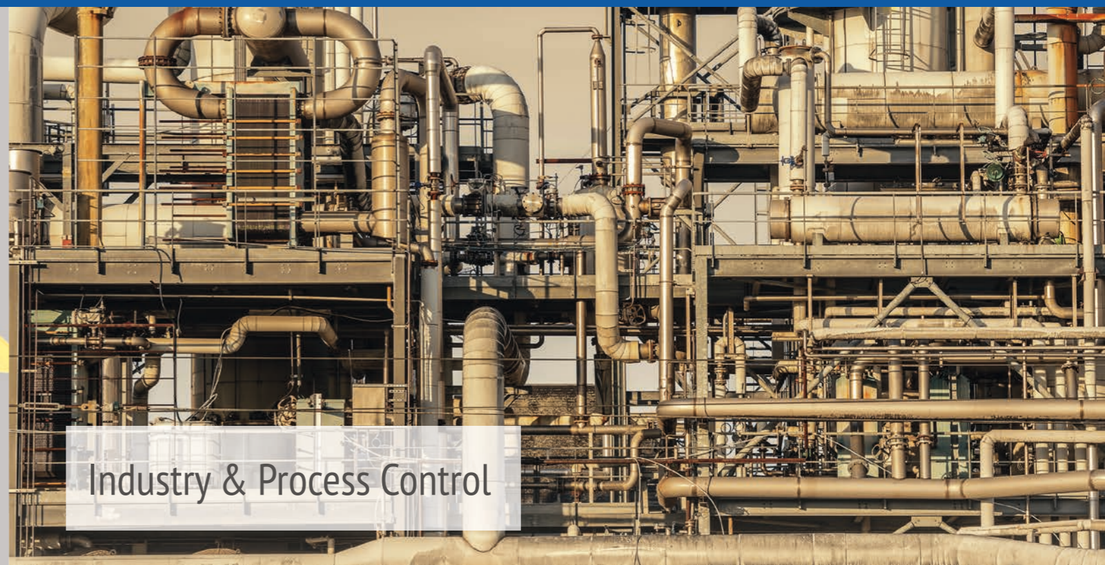
Industry & Process Control

Product identification and authentication same as quality control in general plays a major role in the food and flavour industry.